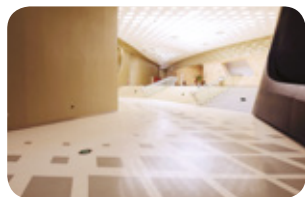
Lobbies & Entrances