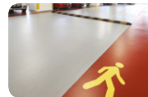
Car Parking Facilities