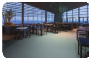
Bars & Restaurants