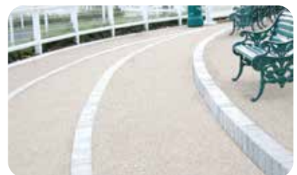
Walkways & Paths