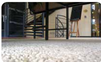
Offices & Lobbies