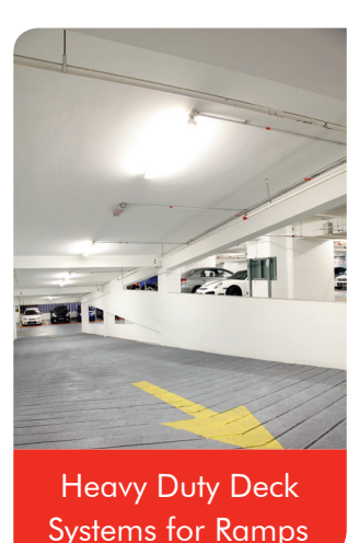
Park Deck Systems

In some instances, ramps are also partially exposed to external weathering and rainwater and there can be significant movement affecting the joints connecting the ramps to multi-storey